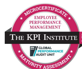
Micro-certificate in Employee Performance Maturity Assessment

NOTE: These three micro-certificates are not offered as part of the Certified KPI Professional Program, they can be purchased separately. For more information, CLICK HERE