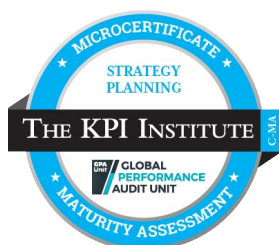
Micro-certificate in Strategy Planning Maturity Assessment