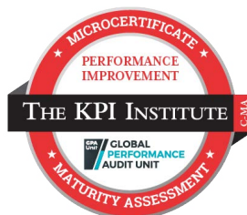
Micro-certificate in Performance Improvement Maturity Assessment